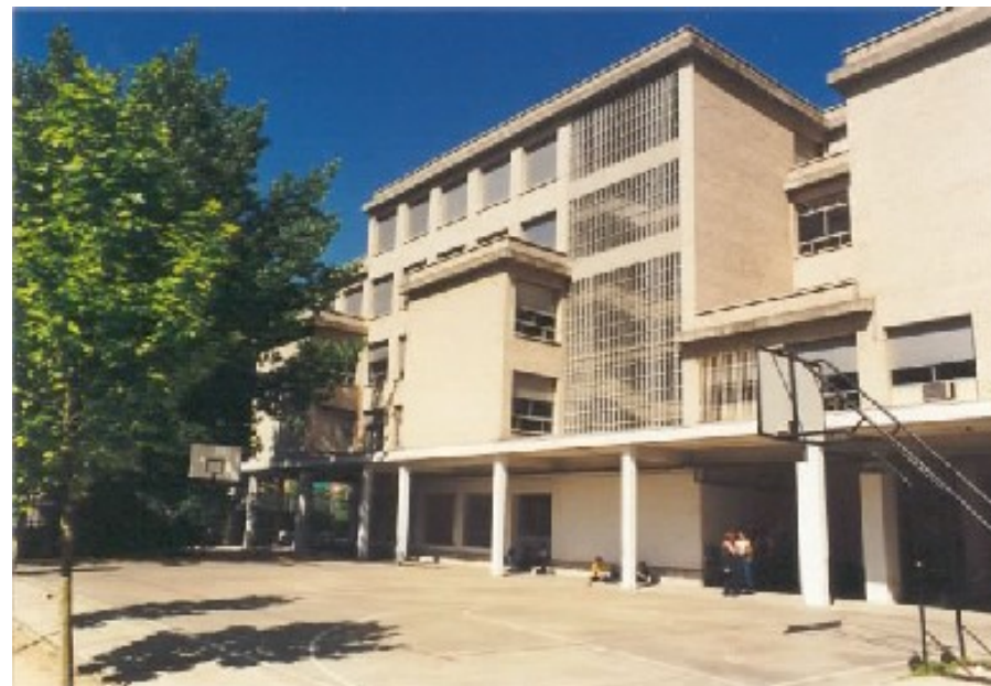
I.E.S. Cardenal Herrera Oria